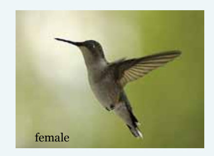
Ruby-throated Hummingbird (Archilochus colubris)

After wintering in Mexico and Central America, Ruby-throated Hummingbirds are on their way back in Georgia! Welcome them with some fresh sugar solution in a clean hummingbird feeder (basin style feeders are easier to keep clean than the inverted bottle kind). Just dissolve one part sugar in four parts water and cool before filling your feeder. You can also provide nutrition by planting nectar-producing flowers. Plants that have red or orange tubular-shaped blooms (like Trumpet Creeper, Crossvine, Coral Honeysuckle, and Salvia) are especially attractive. Hummingbirds also eat soft-bodied insects and spiders, so refrain from using pesticides in your yard if possible.