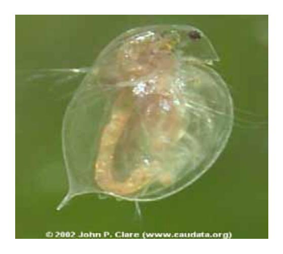
Water Flea, Daphnia magna

The large number of chemicals in used cigarette filters precluded toxicity testing of each chemical. Thus, a test that can estimate aquatic toxicity from the composite of chemicals and compounds found in cigarette butts was used. Using the US Environmental Protection Agency's 1996 "Aquatic invertebrate acute toxicity test for freshwater daphnids" standardized toxicology protocols and procedures, water fleas